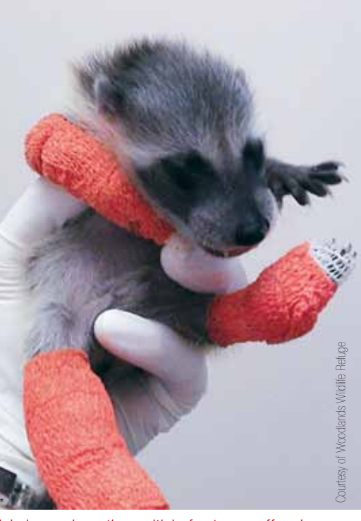
Injuries such as the multiple fractures suffered by this young raccoon require the expert care of a trained wildlife rehabilitator.

To ensure the safety of the public and provide the best care for the animal, only persons who demonstrate proper knowledge and ability to care for injured, orphaned or displaced wild-life—from intake to the point of the animal's release back into their natural habitat—are considered for licensing as wildlife rehabilitators. Being a licensed rehabilitator is a major responsibility and requires time, knowledge and dedication. Wildlife rehabilitators donate their time and do not charge for their services.