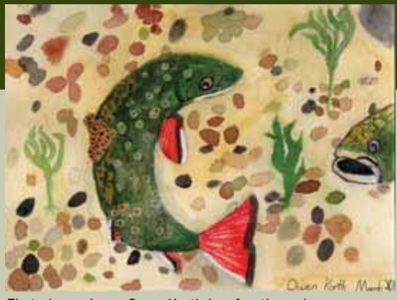
First place winner Owen Korth is a fourth grader from Bordentown.

Students in grades 4–7 can learn about New Jersey's native fish as they research and write a short story about a year in the life of the native fish of their choice. The story must include biological and ecological information such as the fish's habits and habitat, food, etc. Then, using their artistic skills, students must draw a scene from the short story. Students might want to use the New Jersey Division of Fish and Wildlife Web site as an online resource to learn about New Jersey's native fish.