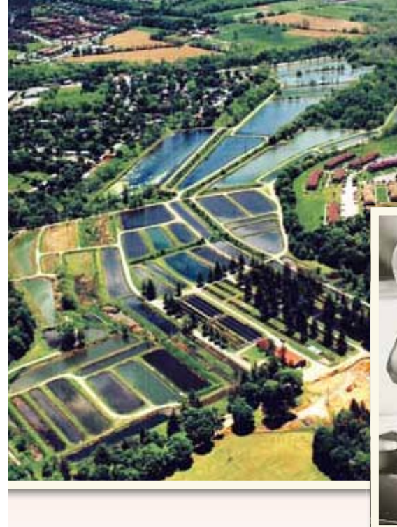
Aerial view of the main Hackettstown Hatchery.