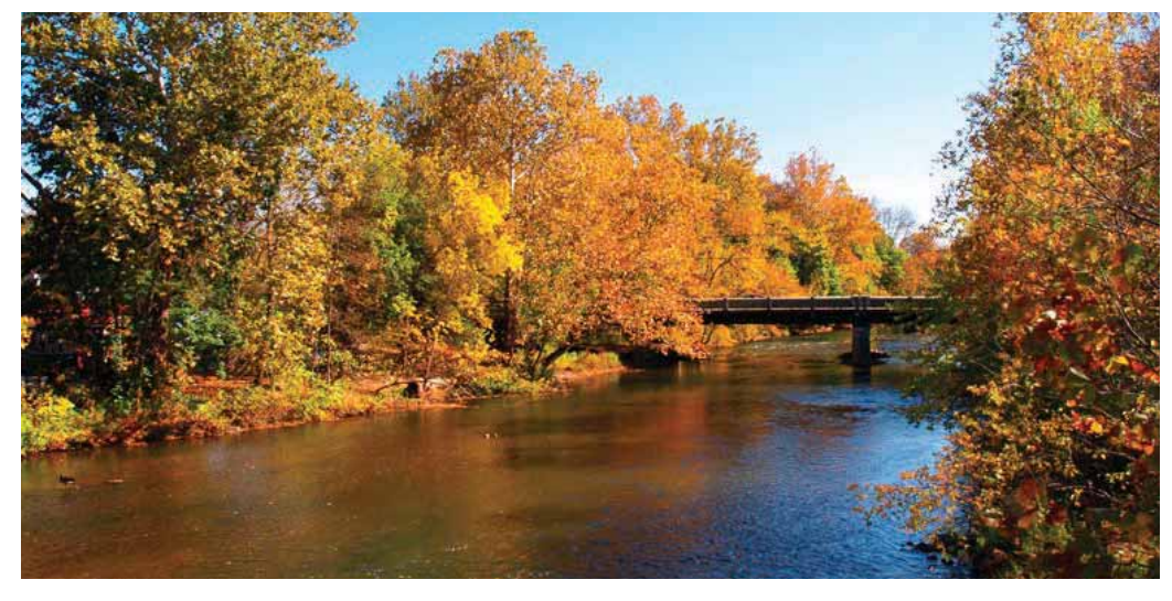
South Branch of the Raritan River near Clinton.

Anglers should also be aware that several procedural changes are now in effect for the Record Fish Program. First, there are different applications for freshwater and saltwater species. Second, for freshwater species, it is now mandatory that a freshwater biologist confirm the identification and weight of any potential record fish within three days of it being caught. Anglers must call Fish and Wildlife's Bureau of Freshwater Fisheries (north/ central) 908-236-2118; (south) 609-259-6964, or the Hackettstown Hatchery at (908) 852-3676 (Warren County) to make arrangements. Hours are Monday-Friday, 8:30 a.m.-4:30 p.m. These offices have a certified scale on site, so an entry can be weighed and identified. Depending on the time and location of your catch, you may elect to have the fish weighed on a local certified scale, but you must still have a freshwater biologist personally