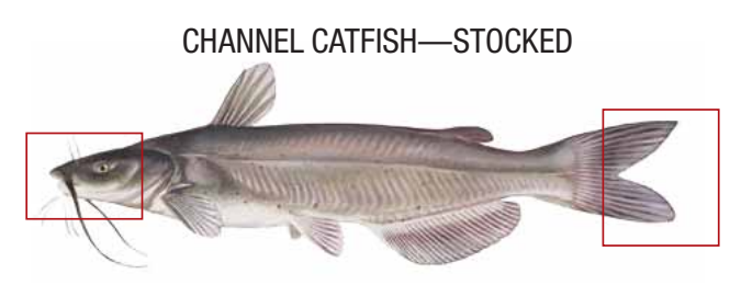
Upper jaw protrudes past lower jaw; tail deeply forked.

Although not a native species, channel catfish are stocked by Fish and Wildlife in select locations as a recreational and food species. The flathead catfish is considered an invasive species capable of causing ecological damage by out-competing other recreationally important species for food and habitat. Flatheads have been confirmed in the middle section of the Delaware River.