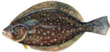
Summer Flounder (Fluke)

Del. Bay and Tributaries 3 Fish at 17 Inches