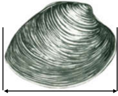
Hard Clam 1.5 inches