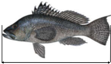
Black Sea Bass