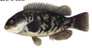
Tautog 15 inches