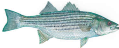
Striped Bass or Hybrid Striped Bass

1 fish at 28 inches to less than 43 inches