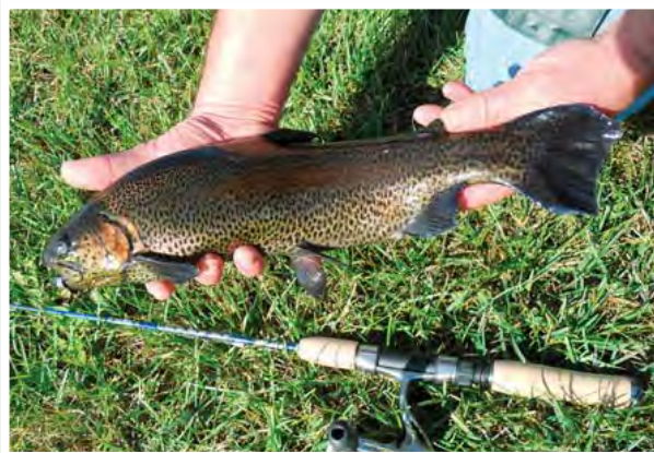
More than 1,000 rainbow trout like this 12-inch beauty will be jaw-tagged for the Hook a Winner Program. Catch one if you can!

In recognition of your catch, a certificate and award patch will be mailed.