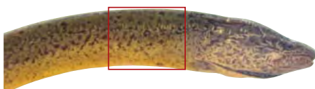
No pectoral fins; no gill slits.

Although not a native species, channel catfish are stocked by Fish and Wildlife in select locations as a recreational and food species. The flathead catfish is considered an invasive species capable of causing ecological damage by out-competing other recreationally important species for food and habitat. Flatheads have been confirmed in the middle section of the Delaware River.