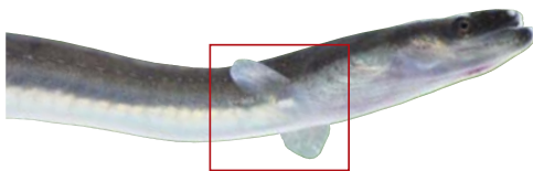
Pectoral fins present; no gill slits.