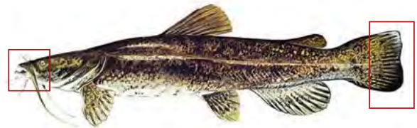
Lower jaw protrudes past upper jaw; tail not deeply forked.