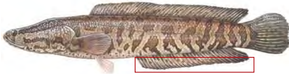
Long anal fin.