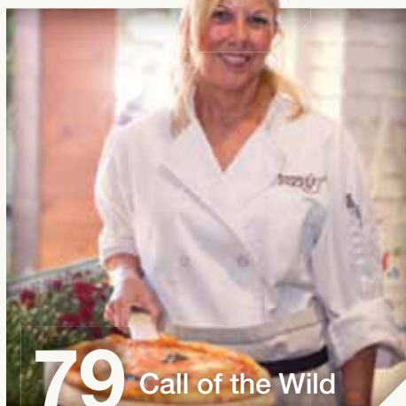
79 Call of the Wild