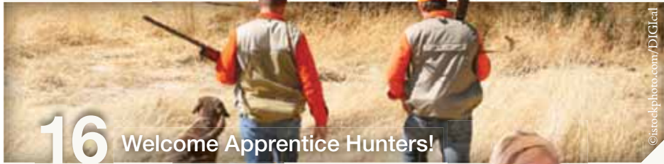
16 Welcome Apprentice Hunters!