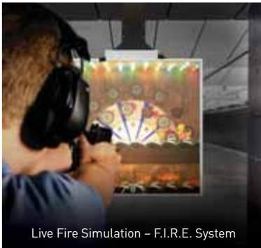
Live Fire Simulation - F.I.R.E. System

SIG SAUER ELITE DEALER - PRODUCT EXCLUSIVES AVAILABLE AT ALL LOCATIONS