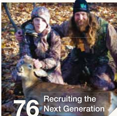
76 Recruiting the Next Generation