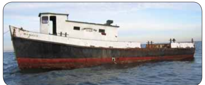
Lucky 7 is one of two commercial fishing boats found on the Axel Carlson reef site.

FACT: Axel Carlson Reef site contains 1,117,980 cubic yards of dredge rock material. Ninety-seven percent of the reef material on Axel Carlson Reef is rock.