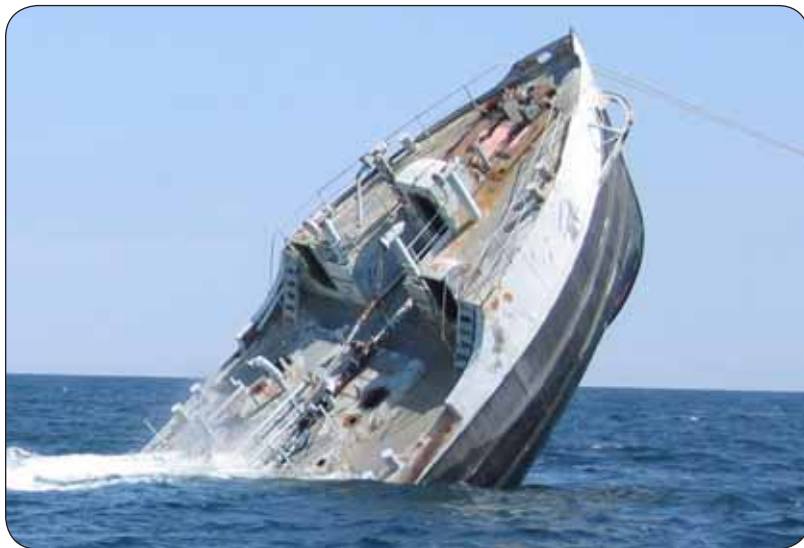
The 15th vessel deployed on the Garden State North Reef. The Helis is a 170' motorized tanker that was named after a beluga whale that came up the Delaware River during 2004.

FACT: Garden State North reef site is home to 15 vessels that total 33,384 cubic yards. Seventy-one percent of the reef material is made up of vessels.