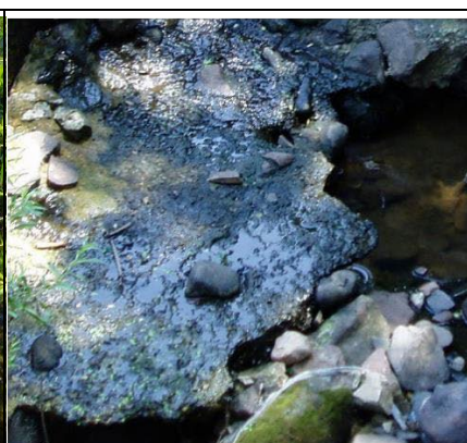
Muck (a mixture of organic material on the surface or banks)