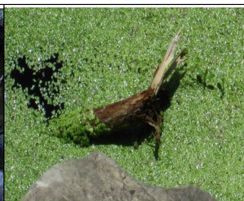
Duckweed (a tiny floating plant with true leaves)