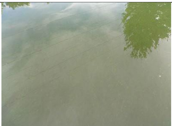
Large green dots