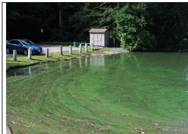
Green streaks parallel to shoreline