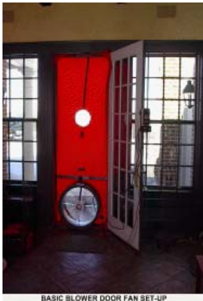
BASIC BLOWER DOOR FAN SET-UP

Blower Door - This device includes a fan mounted on an insert that fits inside a doorway, allowing negative pressure to be generated inside a building to measure air leakage .