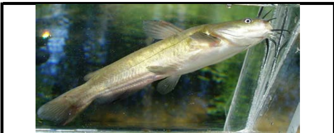
Brown Bullhead Ameiurus nebulosus