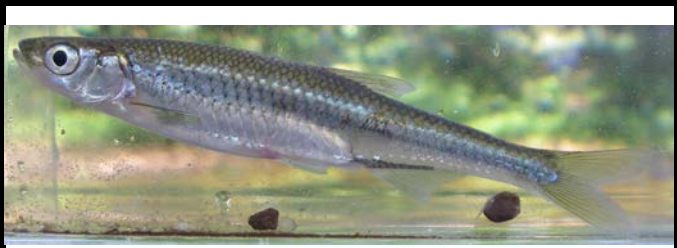
Comely Shiner Notropis amoenus