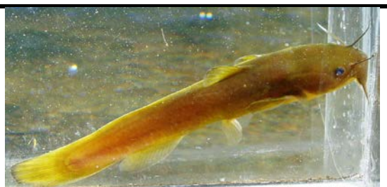
Margined Madtom Noturus insignis