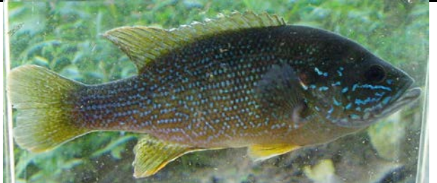
Green Sunfish Lepomis cyanellus