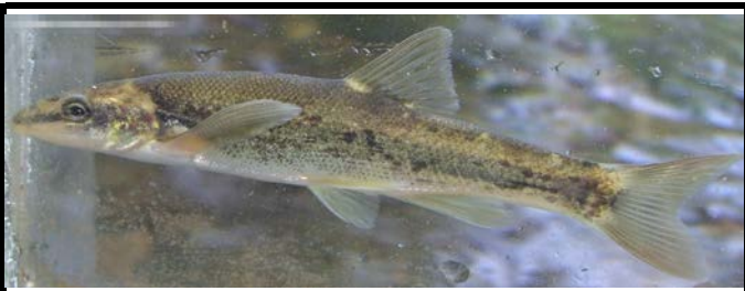
Longnose Dace Rhinichthys cataractae