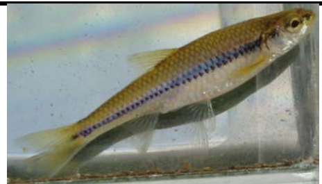
Swallowtail Shiner Notropis procne