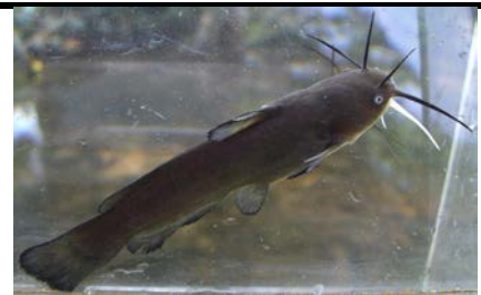
Yellow Bullhead Ameiurus natalis