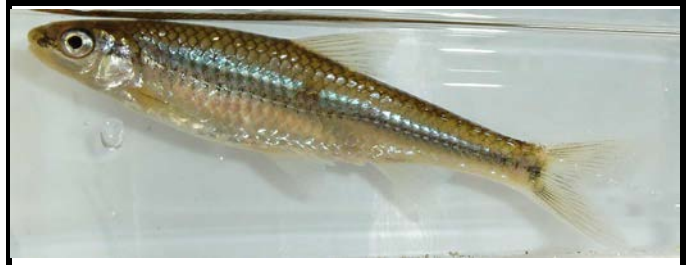
Spottail Shiner Notropis hudsonius