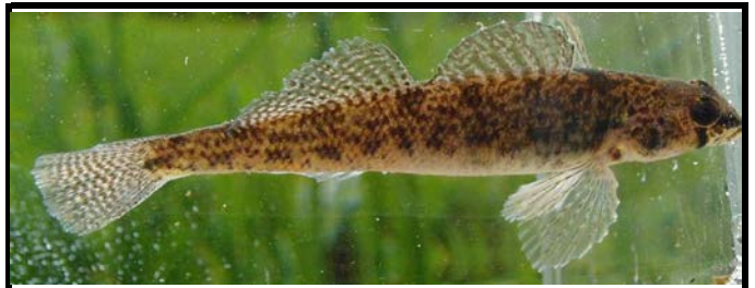
Tessellated Darter Etheostoma olmstedii