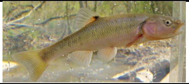
Creek Chub Semotilus atromaculatus