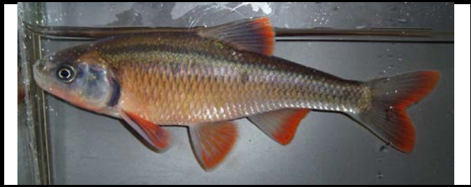
Common Shiner Luxilus cornutus