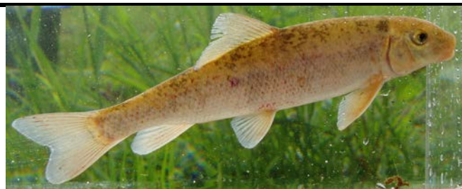
White Sucker Catostomus commersoni