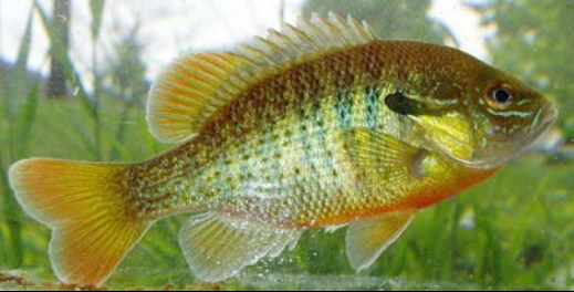
Redbreast Sunfish Lepomis auritis