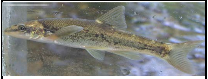
Longnose Dace Rhinichthys cataractae