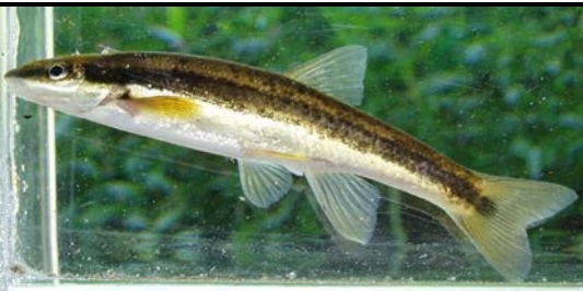
Blacknose Dace Rhinichthys atratulus