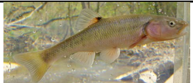
Creek Chub Semotilus atromaculatus