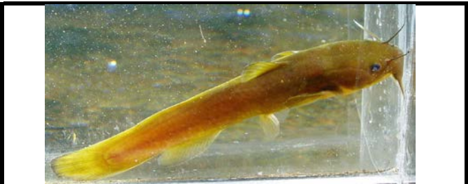
Margined Madtom Noturus insignis