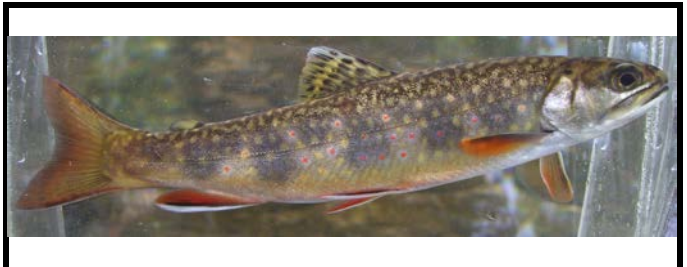
Brook Trout Salvelinus fontinalis