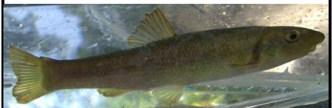
Cutlips Minnow Exoglossum maxillingua