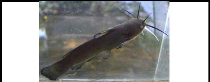
Yellow Bullhead Ameiurus natalis