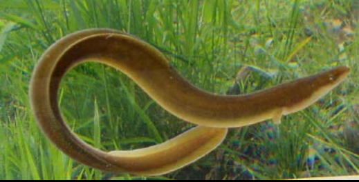
American Eel Anguilla rostrata