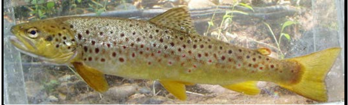
Brown Trout Salmo trutta