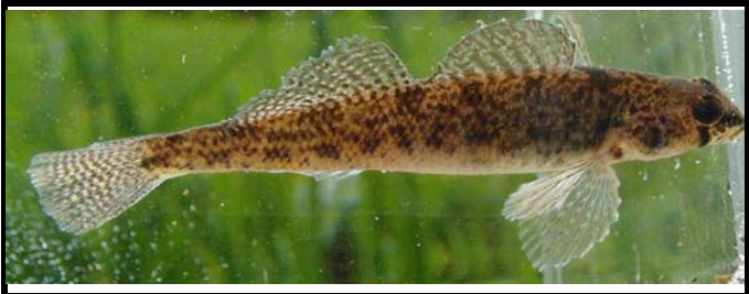
Tessellated Darter Etheostoma olmsted