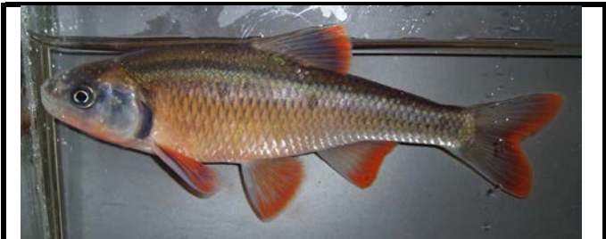
Common Shiner Luxilus cornutus