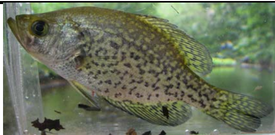
Black Crappie Pomoxis nigromaculatus