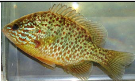
Pumpkinseed Lepomis gibbosus