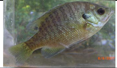
Bluegill Lepomis macrochirus