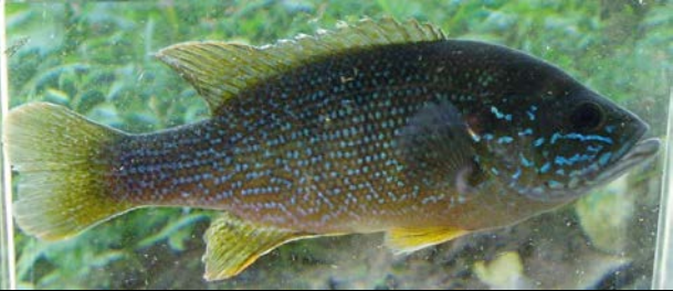
Green Sunfish Lepomis cyanellus