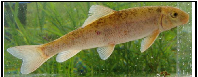
White Sucker Catostomus commersoni