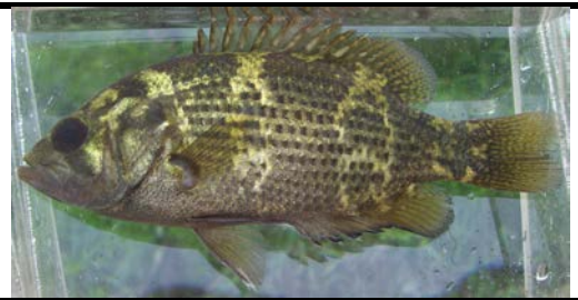
Rock Bass Ambloplites rupestris