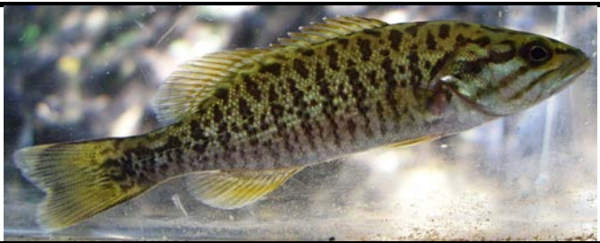
Smallmouth Bass Micropterus dolomieu