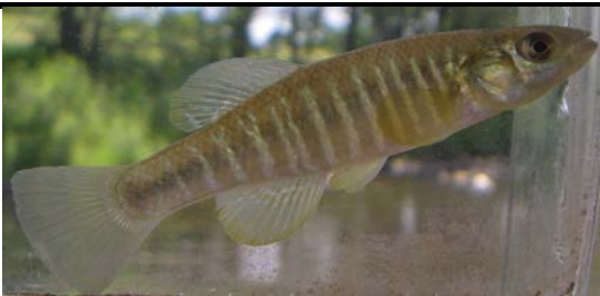
Banded Killifish Fundulus diaphanus