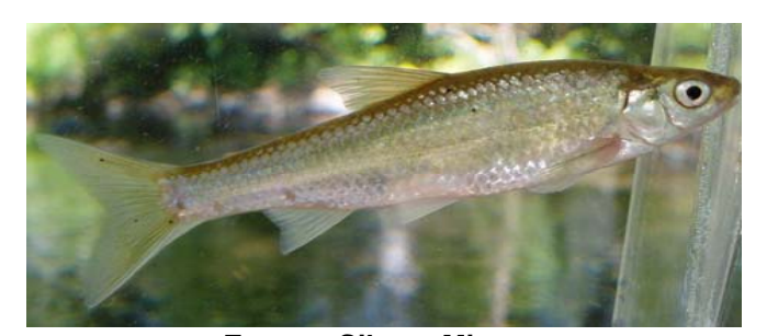
Eastern Silvery Minnow