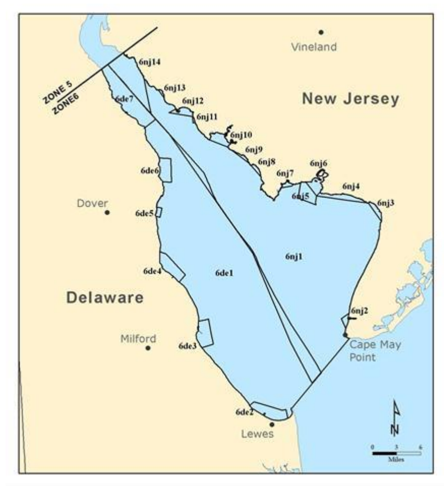
Figure 2. Example Zone 6 Shellfish Management Assessment Units (2010)