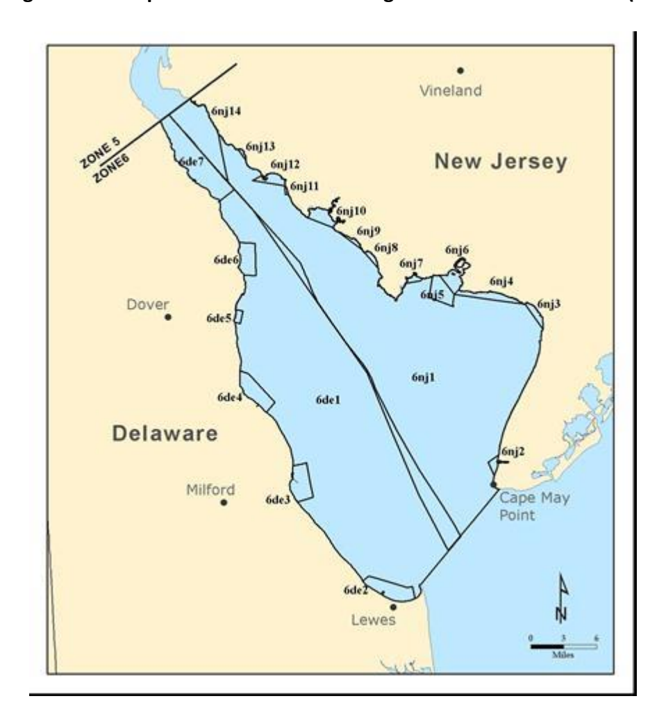
Figure 2. Example Zone 6 Shellfish Management Assessment Units (2010)