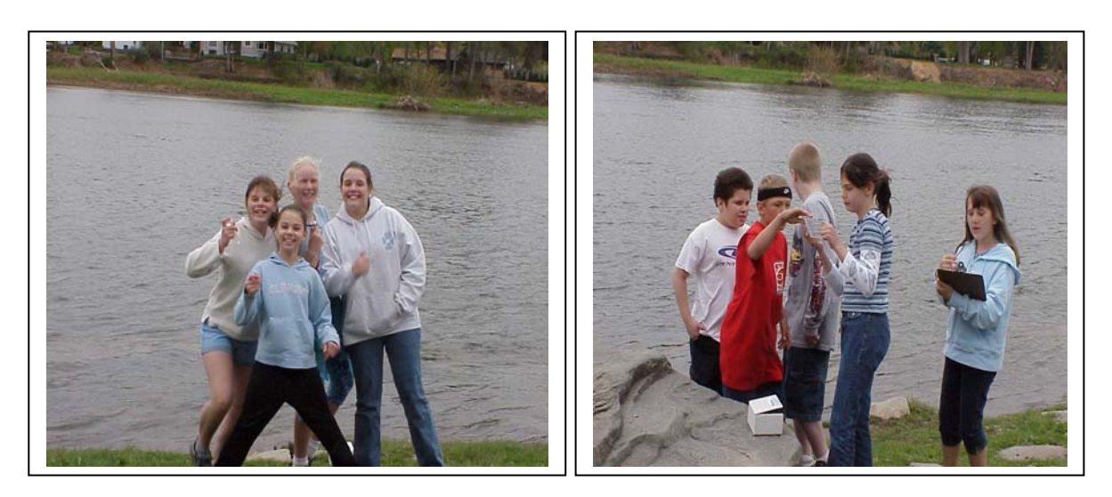
The Delaware River is soft and sleek The Delaware River is not small or meek The Delaware River is a beautiful place The Delaware River will sometimes race

AQUATIC LIFE OBSERVED: algae, rooted plants, fish, crayfish, salamander ,and amphibians. WAS THE WATER CLOUDY? NO