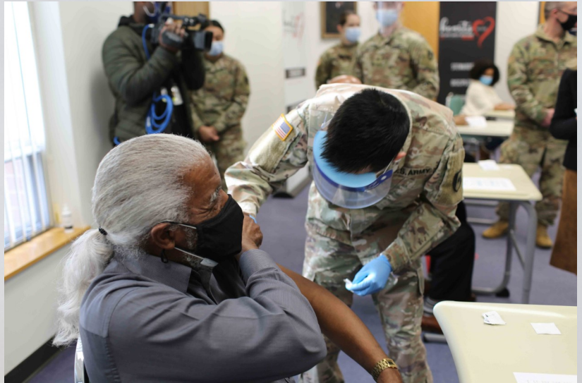
Vaccinations continued this week at the First Baptist Church of Lincoln Gardens in Somerset as part of the state's community-based vaccination partnership. As of Friday, 2,429 First Baptist community members have been vaccinated.