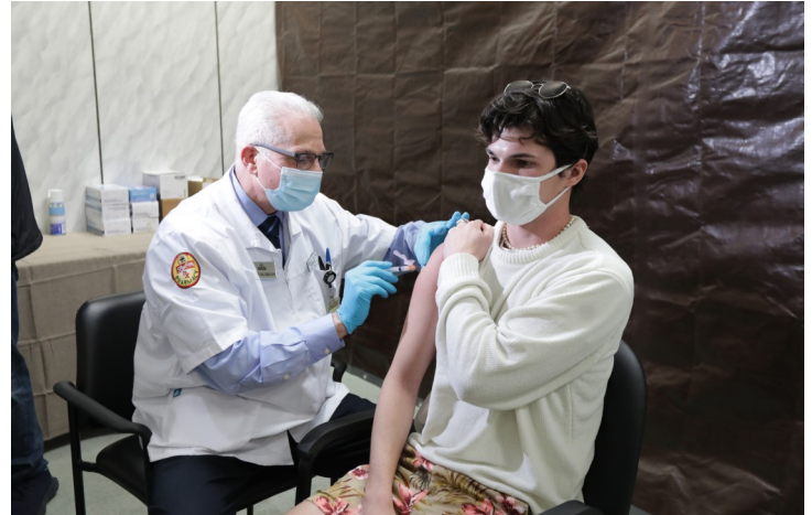
Vaccinations continue in sites statewide such as a ShopRite Pharmacy in Toms River recently.

With several New Jersey colleges and universities requiring on-campus students to be vaccinated against COVID-19 for the fall semester, the New Jersey Department of Health (NJDOH) is making a push to help get their students, faculty and staff vaccinated before summer break.