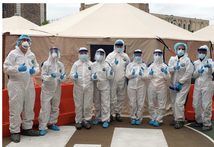
Some of Middlesex County’s MRC team members.

The U.S. Department of Health and Human Services also