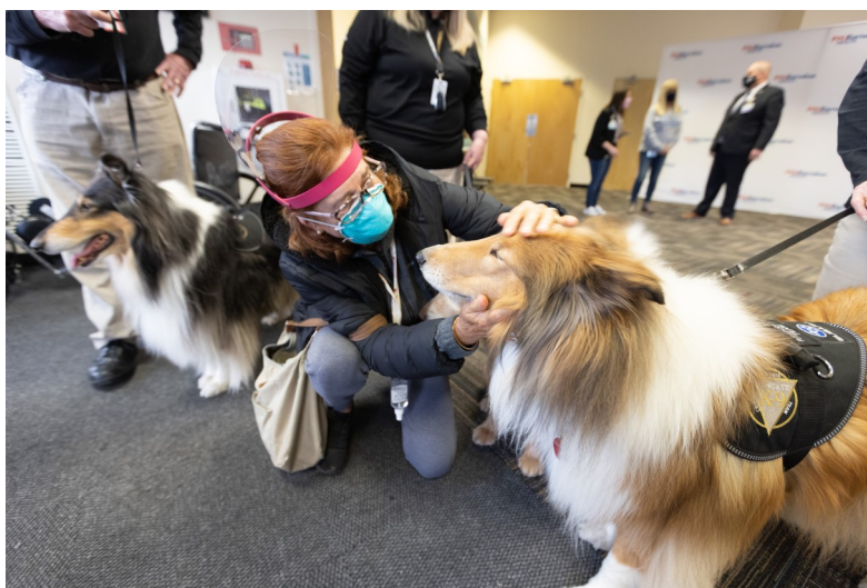
Therapy dogs from the Tri-State Canine Response Team interact with members of the community as part of RWJBarnabas Health’s Hope and Healing program at the Middlesex County mega-site.

To date, nearly 1.7 million total doses have been administered at the mega-sites. For appointment information at the mega-sites and other community sites, visit covid19.nj.gov/finder .