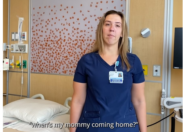
Videos from nurses stress the importance of getting vaccinated and #NoGoingBackNJ. Story on page 2.

The New Jersey Department of Health (NJDOH) has directed the state's vaccination sites to begin administering booster doses of Pfizer COVID-19 vaccine to certain groups at least six months after their primary series following recommendations by the federal Centers for Disease Control and Prevention (CDC).