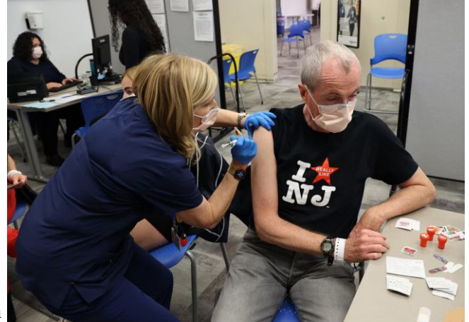
Governor Phil Murphy getting his booster shot at Monmouth Medical Center.

As the state marks the one-year anniversary of COVID-19 vaccinations, if you are not vaccinated yet, protect yourself, your family and community against COVID and its variants, particularly during the busy holiday season of gathering and traveling. If you are eligible for a booster, get one today to further strengthen your protection against the virus.