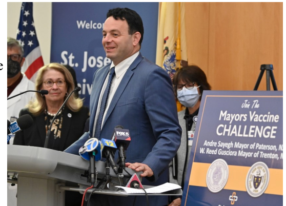
Commissioner Persichilli joins Paterson Mayor Sayegh during the contest announcement last week.

You can follow the progress on the dashboard at covid19.nj.gov .