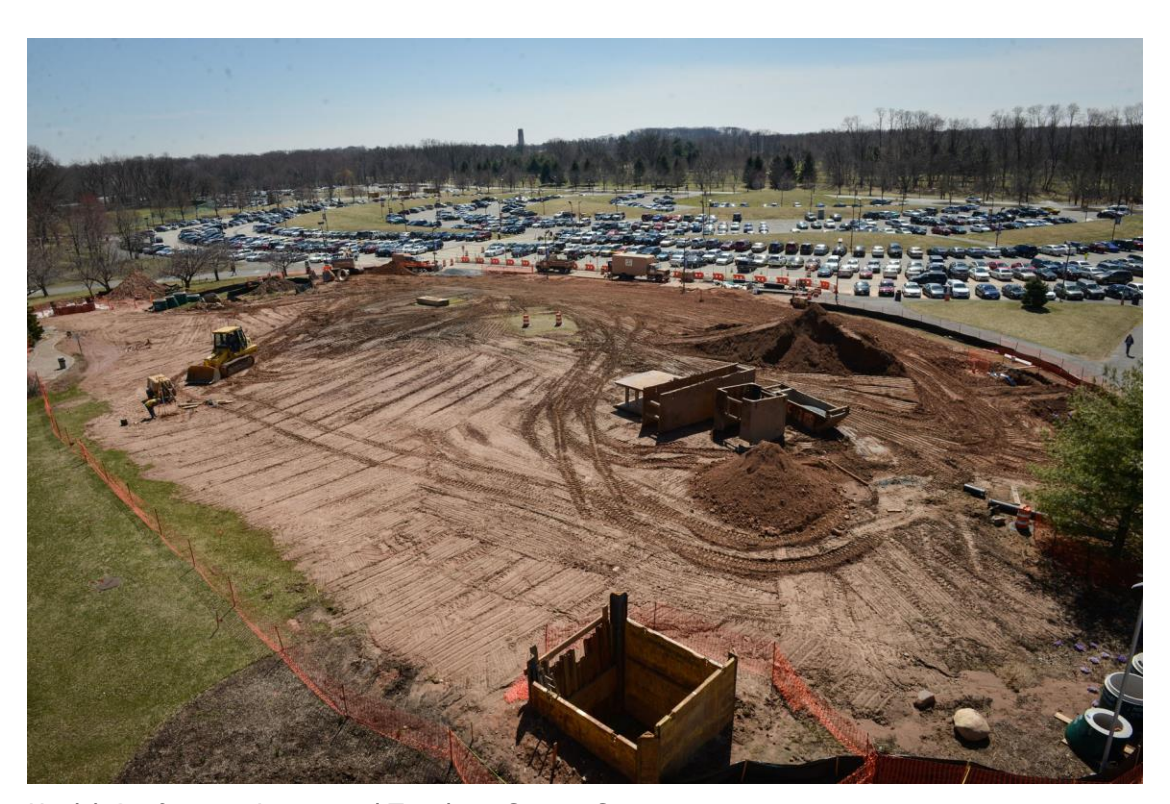
Health Professions Integrated Teaching Center Construction