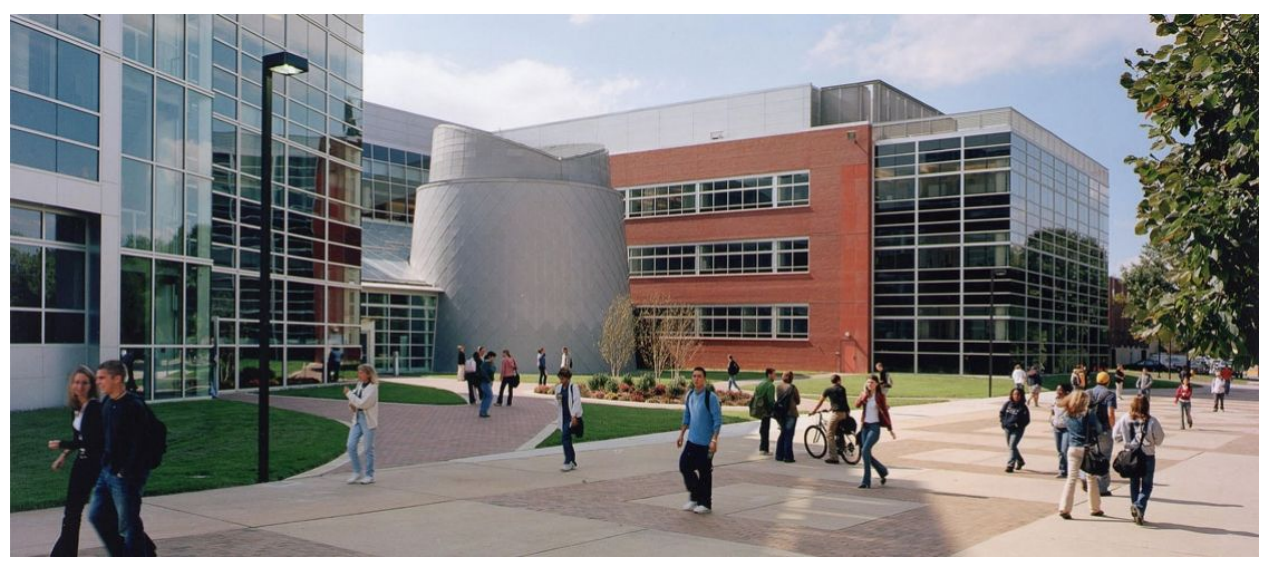
(https://www.rowan.edu/home/about; accessed 08/31/20)