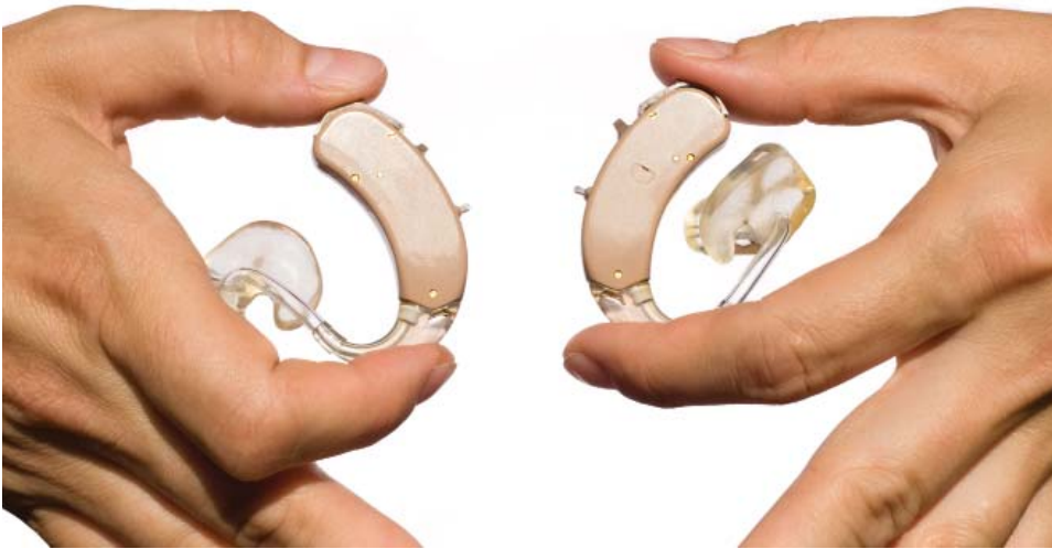
Is the hearing aid on the left the same as the one on the right? One was ordered from a “cheap” internet hearing aid site while the other was properly fitted by a healthcare/audiologist.

across sound frequencies, or pitches, to improve speech intelligibility. Further, depending on whether or not they have wireless capabilities to communicate with each other and/or external devices like smart phones, they are regulated either as Class I or Class II medical devices, respectively.