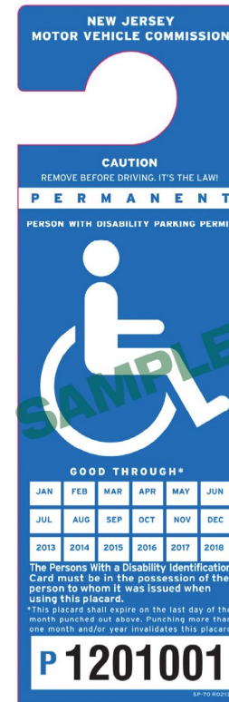
FIGURE 2: Permanent Person with a Disability Placard