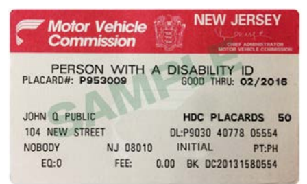
FIGURE 2: Permanent Person with a Disability Placard