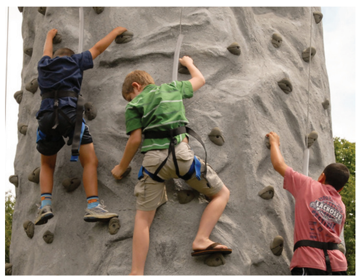
Children of fallen Soldiers enjoy the National Guard rock climbing wall as part of the activities for families at a joint-service Survivor Outreach Services (SOS) Picnic on Aug. 13 at the DMAVA campus in Lawrenceville.. Attendees were treated to lunch, music, and activities such as a rock-wall climb, face painting, bean-bag toss, volley ball, and arts and crafts for the children