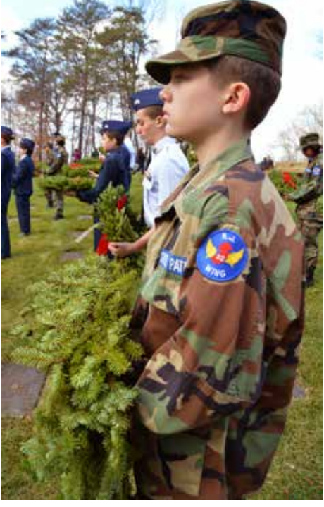
Twin Pine Squadron cadets prepare to place a wreath on a veteran's grave during the Wreaths Across America ceremony at the Brigadier General William C. Doyle Veterans Memorial Cemetery, Wrightstown, N.J., Dec. 13, 2014.