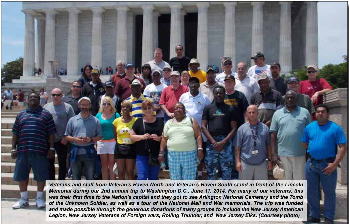
Veterans and staff from Veteran's Haven North and Veteran's Haven South stand in front of the Lincoln Memorial during our 2nd annual trip to Washington D.C., June 11, 2014. For many of our veterans, this was their first time to the Nation's capital and they got to see Arlington National Cemetery and the Tomb of the Unknown Soldier, as well as a tour of the National Mall and War memorials. The trip was funded and made possible through the generous donations of many groups to include the New Jersey American Legion, New Jersey Veterans of Foreign wars, Rolling Thunder, and New Jersey Elks.

WHAT: Military Appreciation Day recognizes the sacrifice of our military and their families. It is a fun day filled with free beach access, parking, music, food and games. Veterans and Active Military are welcome. Any questions please email Rclaudio@boro.belmar.nj.us .