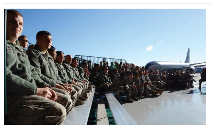
Airmen from the 108th Wing joined service members from Joint Base McGuire-Dix-Lakehurst for a special live broadcast of ESPN's "First Take" hosted by Stephen A. Smith, Skip Bayless and Cari Champion. The "Salute the Troops" broadcast in honor of Veterans Day was set in the VR-64, U.S. Navy hangar. The show was aired live on ESPN2 at 10 a.m. EST and was replayed throughout the day.