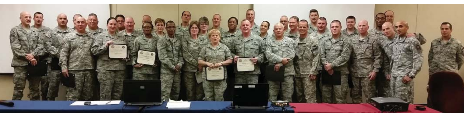
Thirty-nine New Jersey National Guard Soldiers and Airmen attended the National Guard Technician Personnel Management Course at the Joint Training and Training Development Center at Joint Base McGuire-Dix-Lakehurst, N.J., Oct. 23, 2014. The course provides indepth instruction on all aspects of supervisory responsibility of full