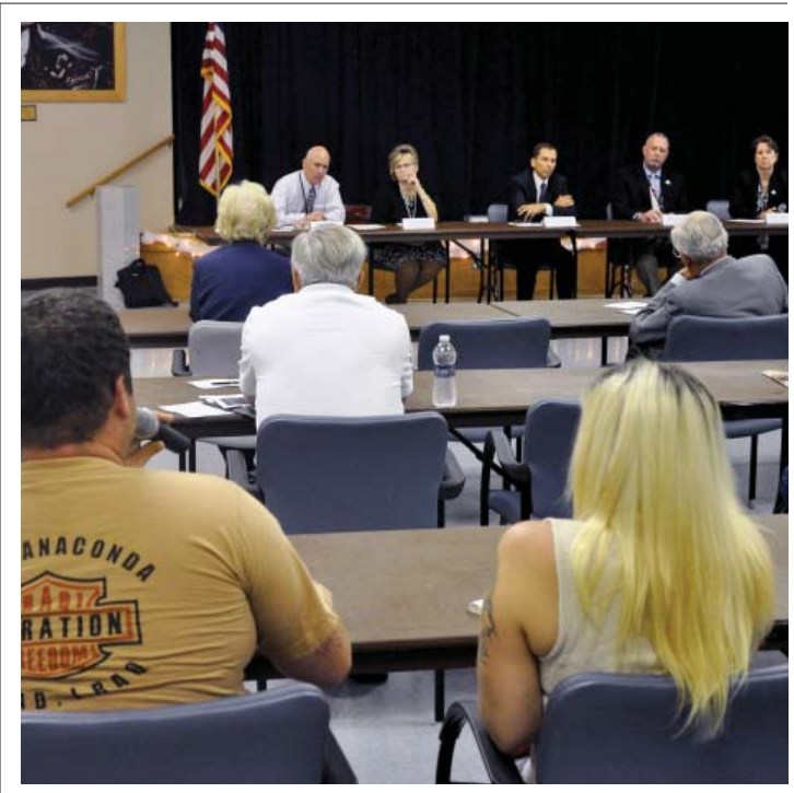
The federal Veterans Administration Wilmington (Del.) Medical Center held a town hall at the Vineland Veterans Memorial Home on Monday. Two dozen veterans came out to ask questions to the medical center staff that overseas VA clinic in South Jersey.