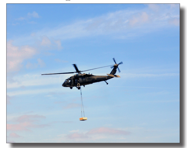
A 1-150th Aviation's UH-60 Blackhawk conducts hoisting and sling loading operations May 16,2014 at Joint Base Cape Cod.

"Everyone cooperated flawlessly." McElroy said. "It's because of our troops' attitude, demeanor and professionalism that great joint training occurred."