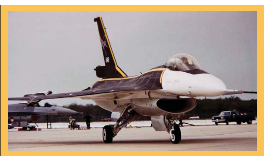
Fact Sheets: F-16XL Laminar Flow