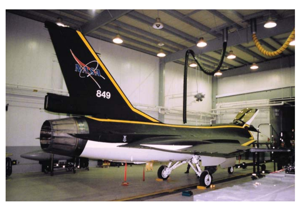
F-16XL undergoing maintenance at the 177th Fighter Wing during the early 1990s.

The historical partnership between the 177th Fighter Wing and NASA was mutually beneficial, allowing Airmen to receive training that enhanced their skills as Guardsmen, while giving NASA the benefit of their years of experience. The 177th has prided itself not only in service to the community, but also to fellow government agencies.