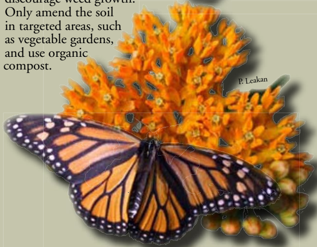
Orange Butterfly Milkweed - July flower

3. Work with Natural Resources: Learning about your yard's soil structure and chemical composition can help you save valuable maintenance time, energy, and money. Test your soil and plant native vegetation. Many Pinelands plants tend to be drought-tolerant and require less water and little or no fertilization. Use mulch to retain soil moisture, reduce water consumption and discourage weed growth. Only amend the soil in targeted areas, such as vegetable gardens, and use organic compost.