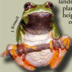
Pine Barrens Treefrog

2. Preserve and Maintain Biodiversity: Preserve natural habitat to provide food, water and shelter that local and migrating animals need to survive. You can attract and provide refuge for birds, butterflies, and other wildlife by landscaping your yard with native plants. Plants that grow to varied heights support a greater diversity of birds and other animals by providing layers of shelter. These steps will make your yard part of the surrounding ecosystem.