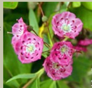
Sandmyrtle - low, compact evergreen