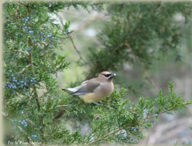
Pat & Clay Stratton