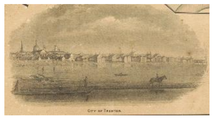
Image of the City of Trenton, map inset from Bond, H.G., Topographical Map of the State of New Jersey . 1860.