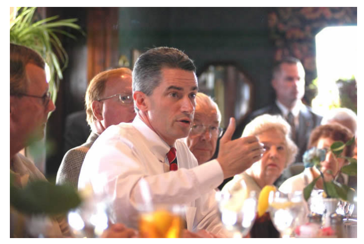
Governor McGreevey is committed to listening to New Jersey's residents and constituents, especially when it comes to planning for New Jersey's future through smart growth. Cross-Acceptance is the way to be sure that everyone is heard.

The planning assistance unit of the Office of Smart Growth is available to assist municipal, county and regional entities in both the Cross-acceptance and the Plan Endorsement processes. To learn more about Cross-acceptance and Plan Endorsement or any of the other programs in the Office of Smart Growth, contact your Area Planning Representative or visit us on-line at http://nj.gov/dca/osg/