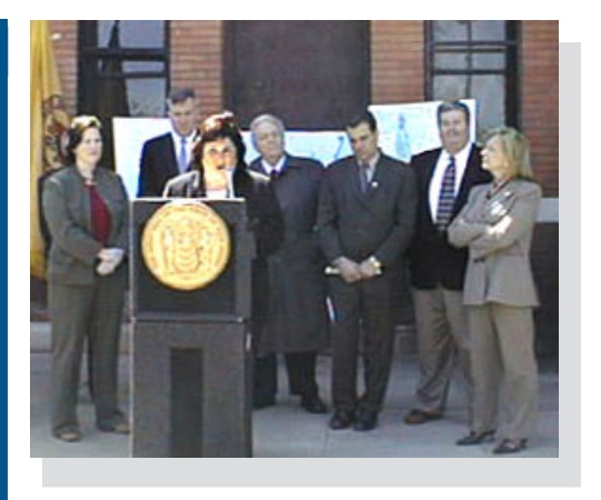
Susan Bass Levin Commissioner NJ Department of Community Affairs

DCA Commissioner Susan Bass Levin announces Smart Future Planning Grants at (top to bottom) Bergen and Monmouth Counties.