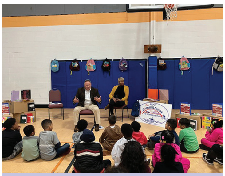
Pictured: School Supply Drive

The generous spirit of NJDOT employees continued to shine throughout 2022, and they continue to go above and beyond their daily responsibilities to help where there is a need. Seeing that commitment in action at NJDOT is a powerful reminder that we play an important role in serving our communities beyond our everyday work duties. I'm inspired by the charities we partner with throughout the state and proud of our employees for helping them fulfill their missions.