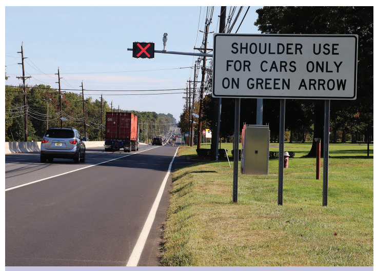
Pictured: Route 1 Hard Shoulder Running Program

NJDOT's Route 1 Hard Shoulder Running Program in South Brunswick, which improved congestion and