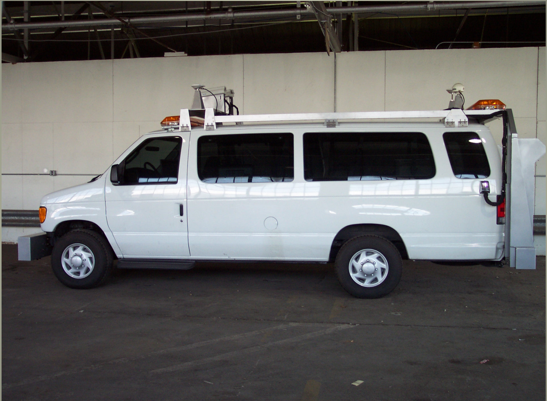
HIGH SPEED PROFILER