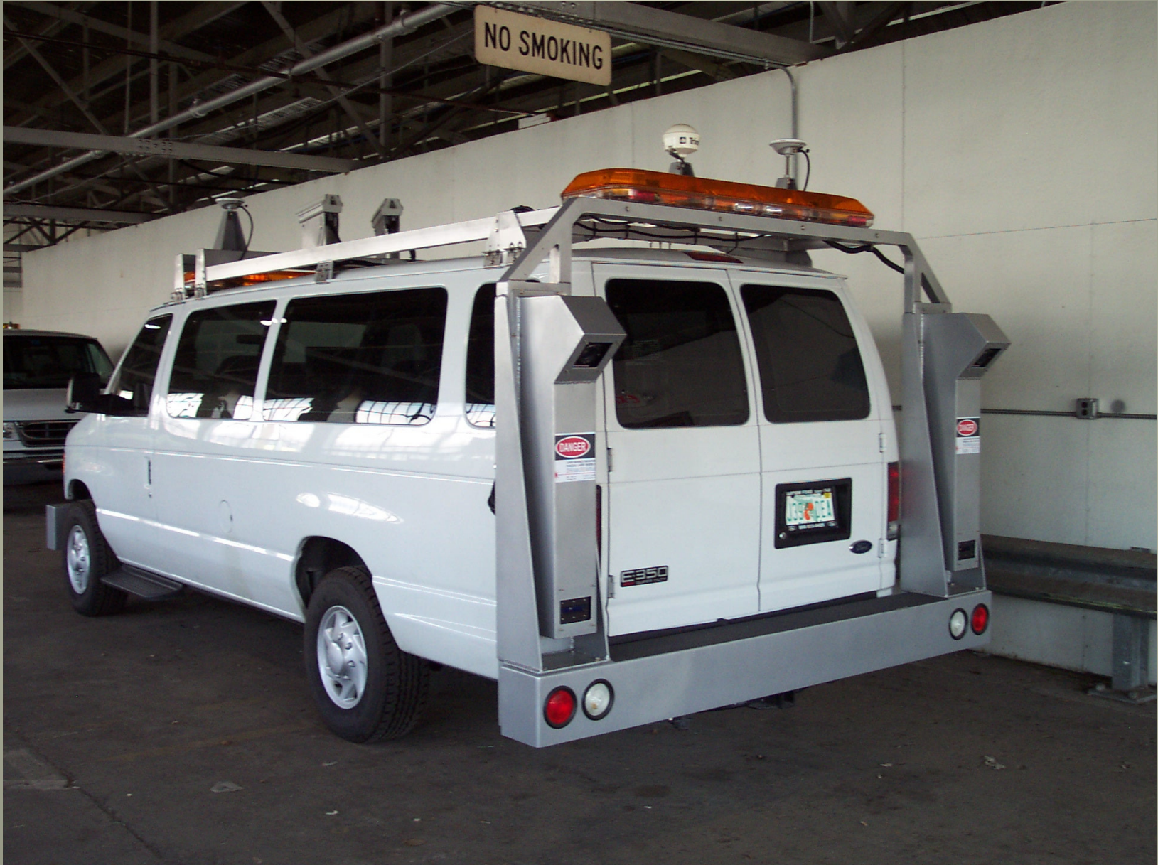
INO Rut Bar