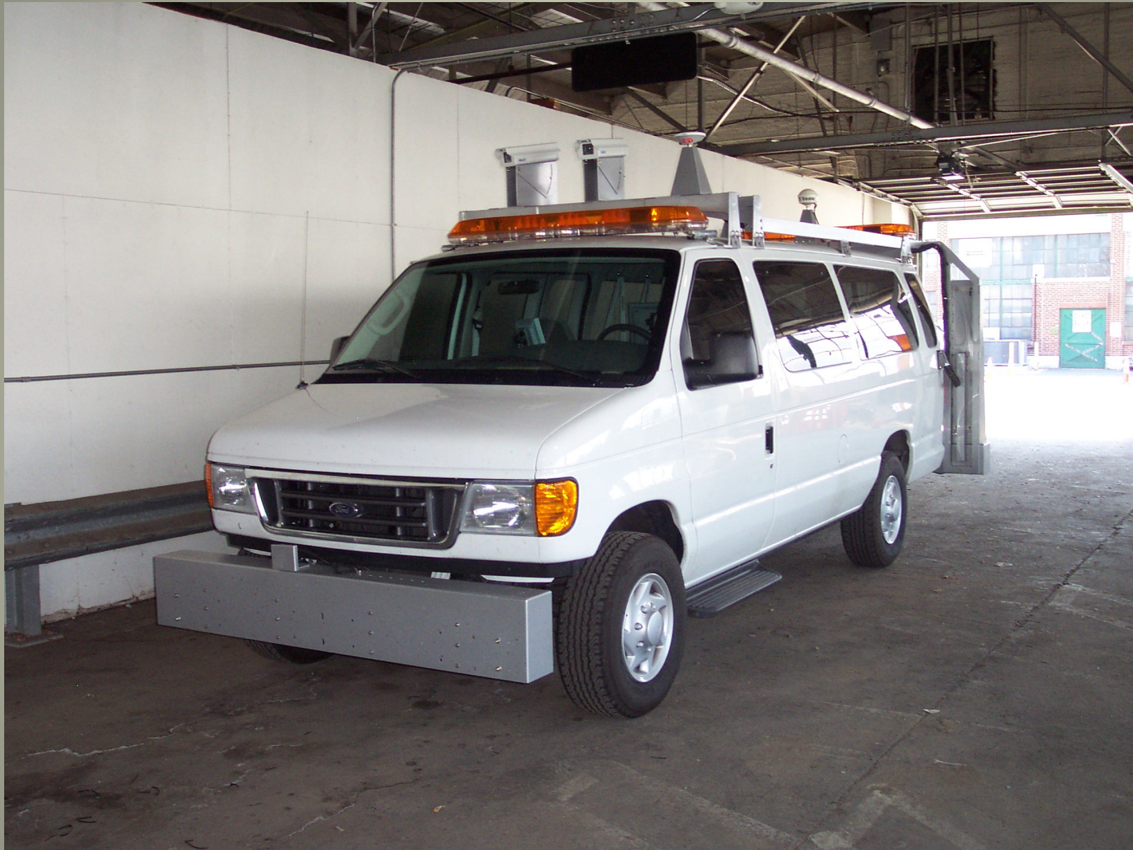
Front end showing cameras, GPS and laser box