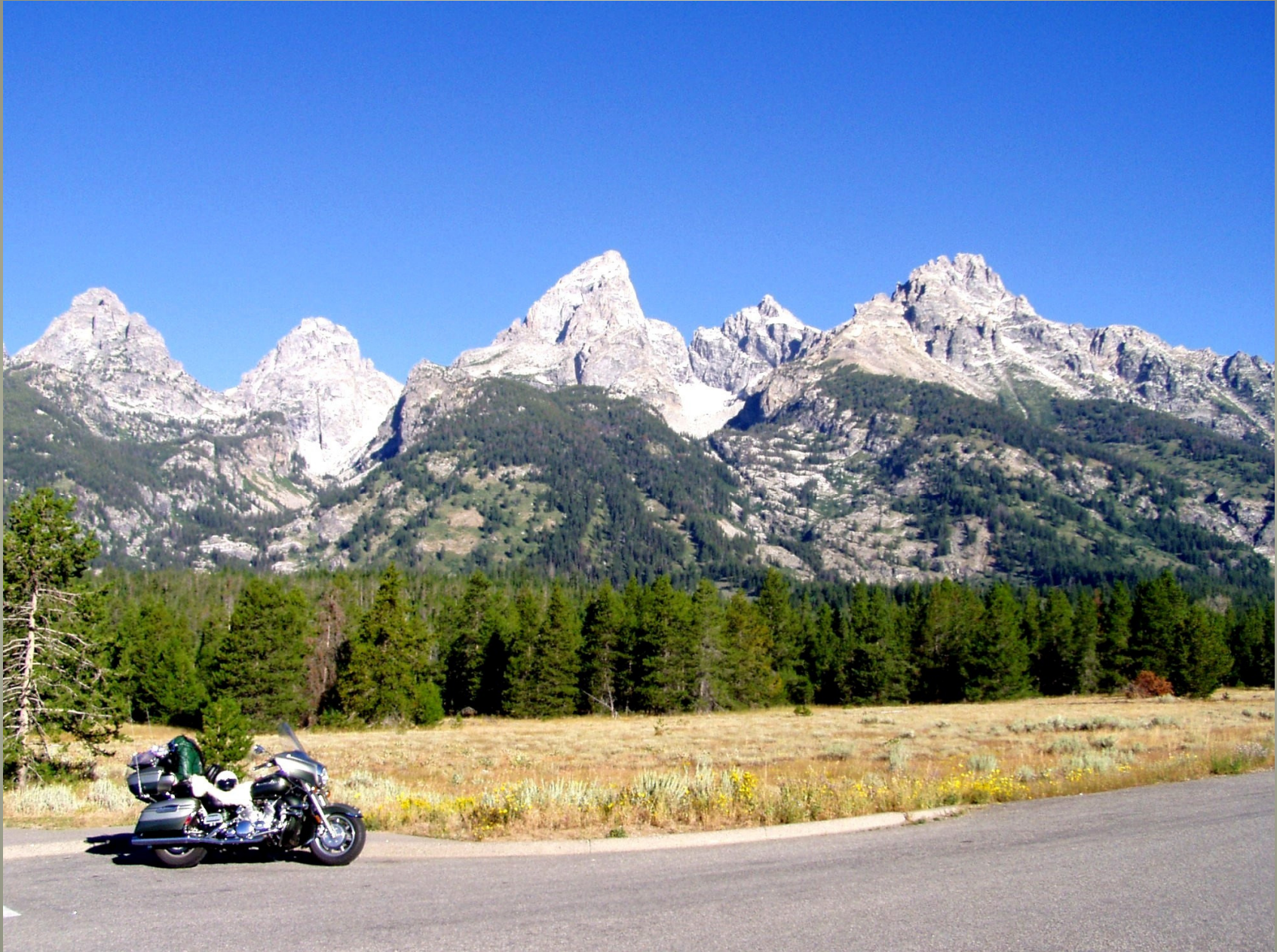
ROADWAY DATA COLLECTION VEHICLE